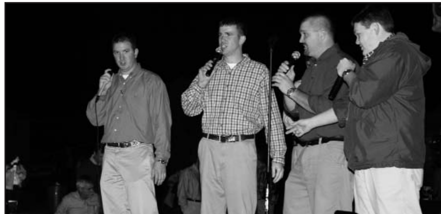
The Basford Brothers Quartet entertained a large crowd with Southern Gospel favorites during the annual Holiday Homecoming event at BCF.

Later after she poured up the mixture, the children stood in wonder as she