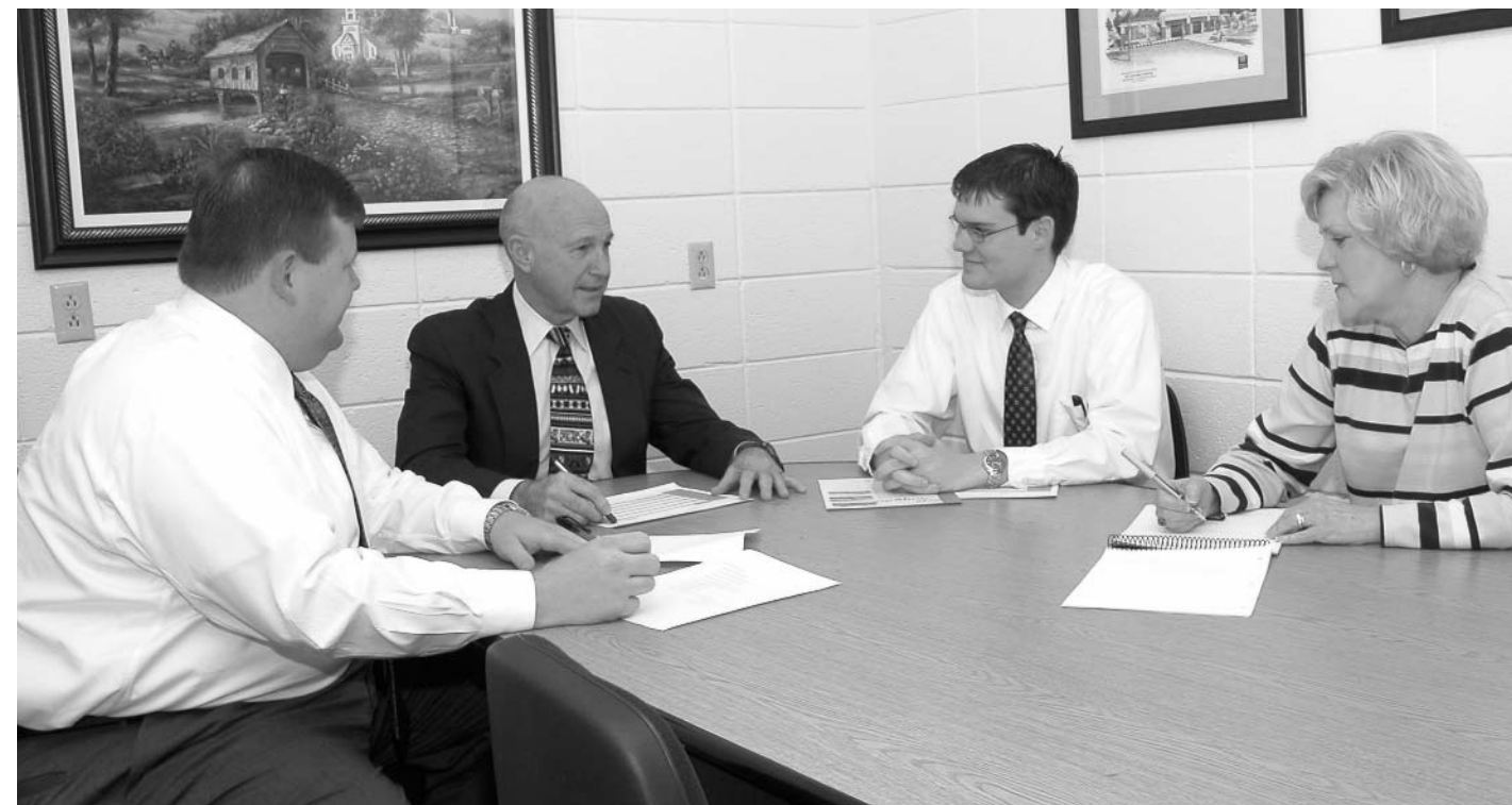
The Institutional Advancement office staff discusses the upcoming "Just Imagine" campaign at a staff meeting.

A long-time friend of the college, BCF's new vice president for institutional advancement chats with the editor of Echoes about his new found responsibilities as a member of the college's administration and what it's like to now be on the inside at BCF.