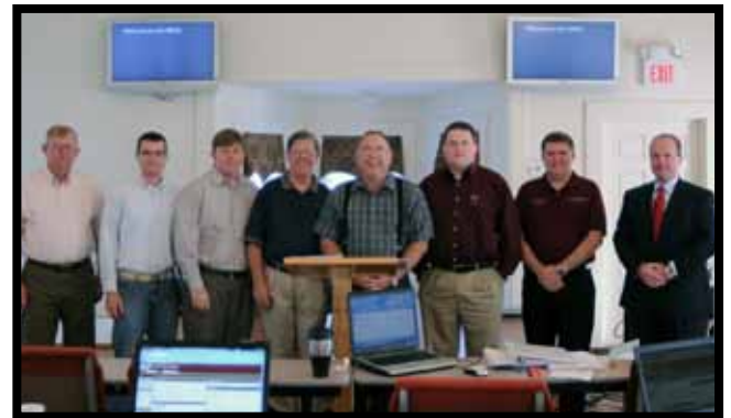
Members of the first graduate research class.

According to Scott the first two classes have been tremendously suc-