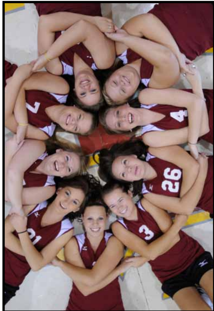
BCF Lady Eagles Volleyball Team